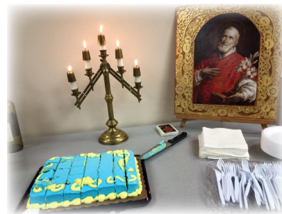
Birthday cake for St. Philip's 500th birthday