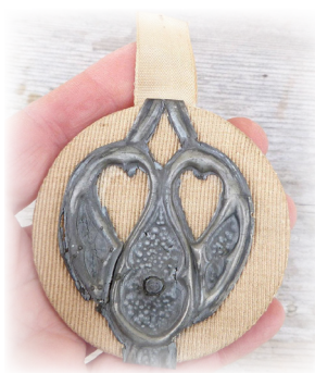
A piece of St. Bernadette's casket