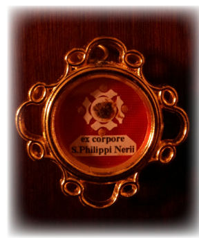
A relic of St. Philip Neri