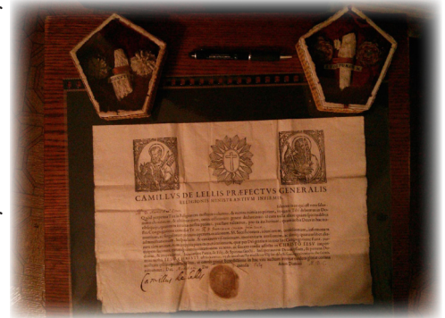
A letter from St. Camillus de Lellis and relics of early Christian Martyrs, Sts. Modestus and Fortunata