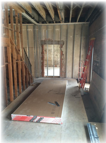
The future foyer of the Pious House

Work on the Pious House finally began in May. We are thrilled that work is underway, and are hopeful for completion of phase one in late October or November. This will enable us to accept more vocations in the near future, providing us with the future priests who will help us get to Heaven. Thank you to everyone who helped us arrive at this point. The next newsletter will focus on the completion of the Pious House. Please watch the webpage and Facebook for open houses in the fall.