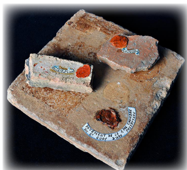
Pavers from the home of St. John Vianney