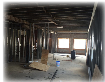
Pious House Renovation