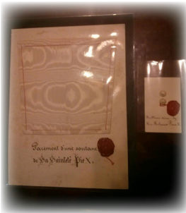
A piece of St. Pius X's cassock sick.

As a community, we value the ancient practice of venerating the relics of the saints. Among our most prized relics are those of St. Philip Neri. It is a great blessing for us to have fragments of his bones, flesh, and heart. The ancient custom of adorning the altars with the relics of the saints (in particular the martyrs) is practiced faithfully in our parish church as well as regularly using the relics of various saints to bless the congregation on the saints' feast days. Our community is also privileged to have a number of other special relics such as a complete stone paver from the bedroom of St. John Vianney, a poster signed by then Cardinal Karol Wojtyla supporting Catholic culture in Poland, a document issued and signed by St. Camillus de Lellis who knew St. Philip personally, a papal bull issued by Bl. Pius IX, and large fragments from the cassock of St. Pius X. Our community is also in possession of documents and signatures from St. Francis Xavier Cabrini, Bl. John Henry Newman, Fr. Frederick Faber, Bl. Charles de Foucauld, Bl. Leopoldo de Gaiche, Bl. Teresa of Calcutta, and others. Such items make the lives of our beloved saints tangible and real. Let us follow their example in our real daily lives!