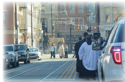
The Community assisting with a Holy Name Eucharistic Procession through the streets of downtown