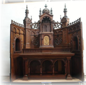
The Altar for our Chapel

As the Pious House nears its completion, our community will begin to have the space and accommodations needed to accept more members. When this renovation is complete, we will begin to set our eyes to what is the most important aspect of our life, the chapel. For the priest, a life centered on Christ is the most important factor, particularly through devotion to Christ in the Most Blessed Sacrament brought about by the Sacrifice of the Mass. Similarly, the life and breath of our community must come from prayer and union with Christ.