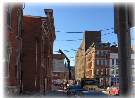
Drywall being delivered on November 19