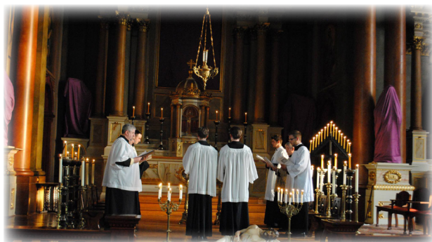
The Office of Tenebræ at Old St. Mary’s

Please join us for this marvelous evening of sung prayer on April 14 at 7:00 p.m. Programs with chants and translations are provided for all in attendance.