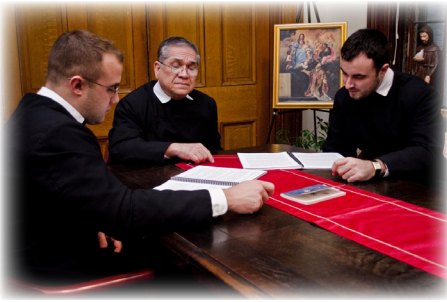
Studying the Constitutions in 2012

For nearly two years, I have been privileged to work with the sick and dying in hospitals. When many hear this, their first reaction is so often to acknowledge the difficulty of the heavy stories that are all too common in the hospital setting. Yet, despite this reality of suffering and death, it cannot be forgotten that some of the most heroic and saintly displays of suffering, surrender to the Will of God, Faith, and complete trust and confidence in Divine Providence are manifest to those who would see it. As such, I have been blessed to share some of the most intimate moments in the lives of complete strangers, who are, in just a moment, made closer than blood through faith and sacrifice united to Christ Himself.