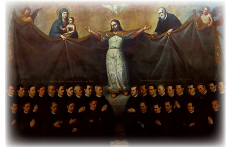
Our Lord, Our Lady, & St. Philip with the saints and blessed of the Oratory

“Apart from the Cross there is no other ladder by which we may get to heaven.” These words of St. Rose of Lima ring true each day, and my work in the hospitals has shown to me the war that occurs in every hospital and the battle that is waged for every soul. The devil makes his last attempts to snatch the souls of Christ, while Christ, the angels, and the saints make every effort to safely see souls to final perseverance. The sick and the dying ought to be in our prayers each day. There will be no better advocates for us when our time comes than those who have suffered, yet, in some way, been relieved by our prayers. It is a corporal work of mercy to visit the sick, and it is a spiritual work of mercy to pray for the living and the dead. We ought to consider carefully each of these and ask ourselves how we might aid the sick in the carrying of their crosses. Please pray for me as I continue in this work, which has the potential to unlock many graces.