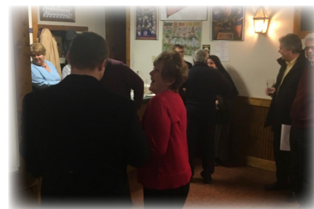
Socializing with parishioners after Sunday Mass in the Rathskeller