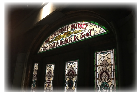
The front door of the Pious House