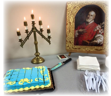
A celebration for St. Philip Neri