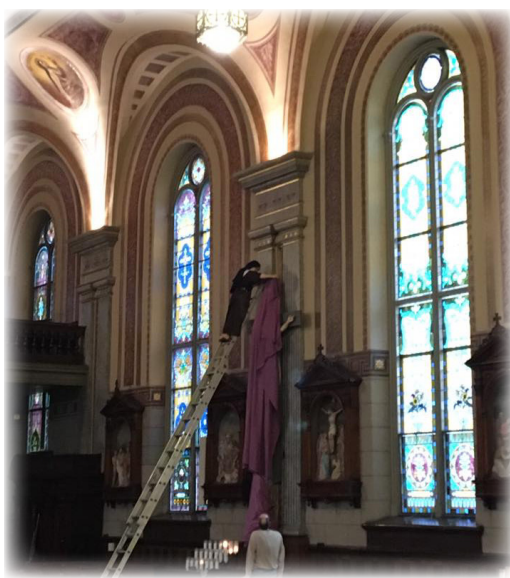
Preparing for Passiontide by covering the statues and paintings

Each Holy Week, The Cincinnati Oratory comes together, with the faithful, on Good Friday to chant the ancient Office of Tenebræ. Tenebræ, which is literally translated “darkness,” is a special singing of the Divine Office on the three days prior to Easter—Maundy Thursday, Good Friday, and Holy Saturday—entirely by candlelight. The structure of Tenebræ is the same for all three days of the Sacred Triduum. The first part of the service is Matins, which is composed of three nocturns, each consisting of three psalms, a short versicle and response, a silent Our Father, and three readings (lessons), each of these is then followed by a responsory. Matins is then followed directly by Lauds, which consists of five psalms, a short versicle and response, and the Benedictus, followed by Christus factus est, a silent Our Father, and the appointed prayer for the day.