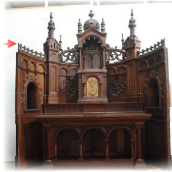
The altar that will be in our chapel once it is completed