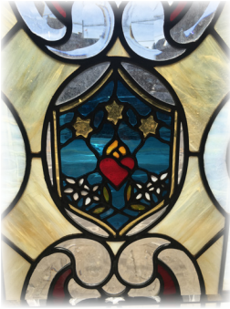
St. Philip's coat of arms in a window on our front door