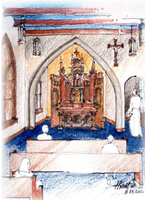
A proposed concept of the Oratory's Chapel

It is with the greatest joy that I announce that on March 19, the Holy Father issued a decree establishing The Cincinnati Oratory. All of our collective prayers and work have finally led to this joyous time. It was only with your generosity and support that we were able to come to this new chapter in our history.