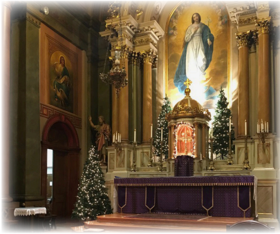
Preparing Old St. Mary's for Christmas