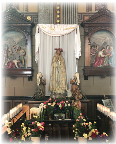
The May Altar at Old St. Mary's

Many among the clergy and laity conclude their prayers with a hymn to the Blessed Virgin Mary. There are four such hymns, the fourth among these being said from Trinity Sunday until Advent, the Salve Regina .