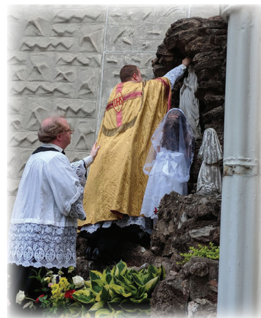
May Crowning at Sacred Heart

Mary’s assumption and glorification are the organic development of her motherhood, perpetual virginity, and immaculate conception. These privileges flow from her deep faith and radical obedience. By her entire life, she becomes the model of the Church; and, by her Assumption in particular, she is the model of Christians, who hope for the eternal life Christ promises.