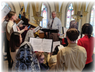
The Schola singing at Sacred Heart