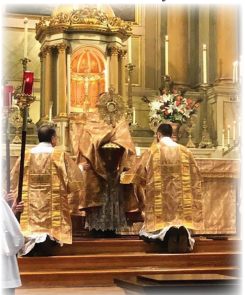
Corpus Christi at Old St. Mary's