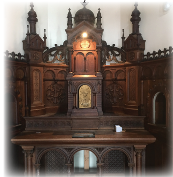
The work progresses on the chapel