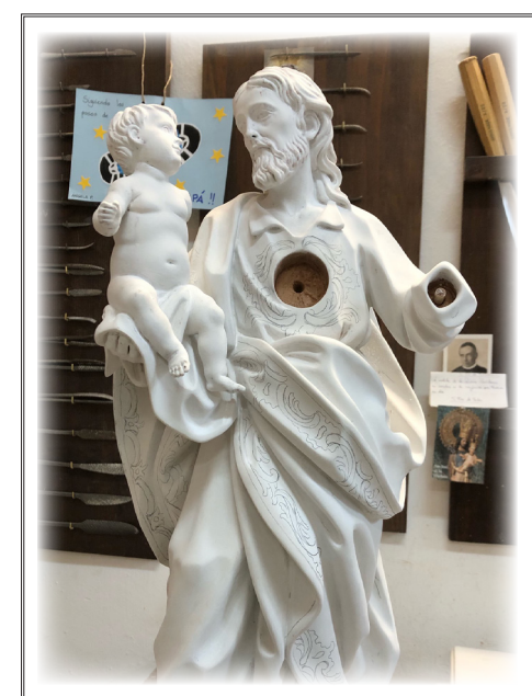
The statue of St. Joseph and Our Lord and where the relic of his cloak will go

Thank you so much for your generosity and, most especially, for your prayers!