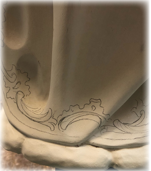
The outlines for the painting of the statues