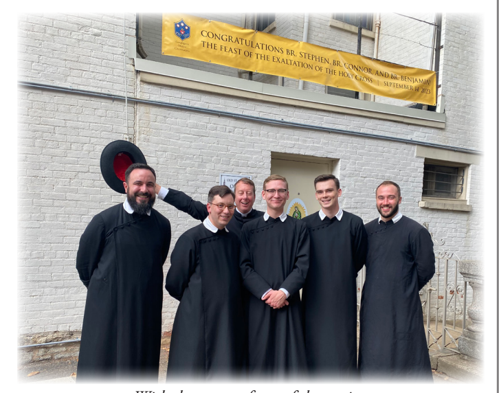
With the pastor of one of the novices