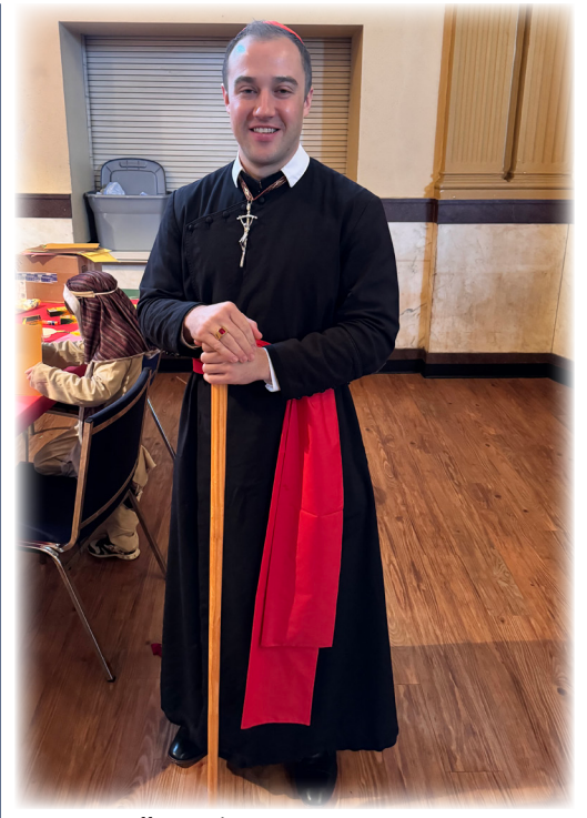
All Saints' Day costume party 2023