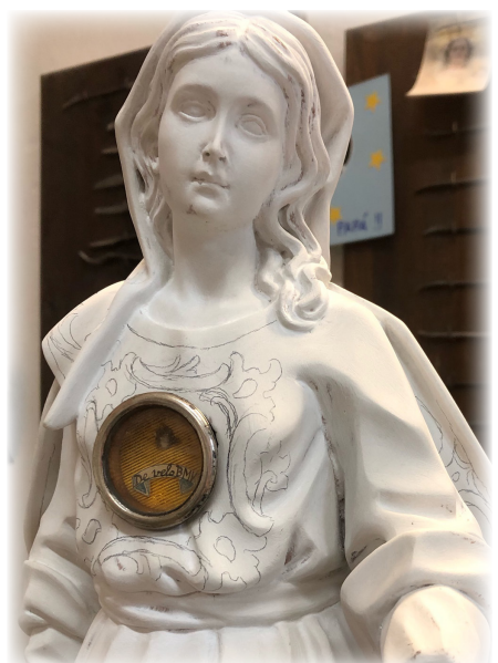
The Statue of Our Lady and the relic of her veil