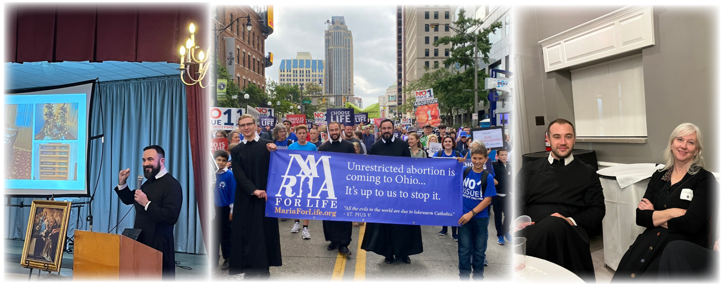
Annual Gala 2023