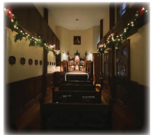
The chapel decorated for Christmas 2020