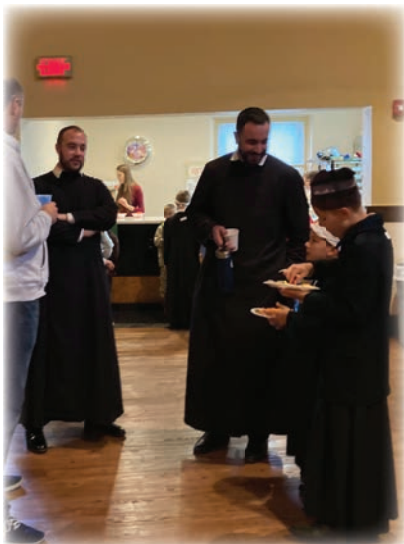
The annual All Saints’ Costume Party

Fortunately, we do not have to face the same struggles that St. Lawrence overcame. Nevertheless, in little ways, we are daily called to suffer for our faith. May we do so with the same spirit of courage and good humor that animated St. Lawrence!