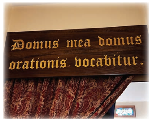
The new wood carving entering the chapel, "My house shall be called a house of prayer."