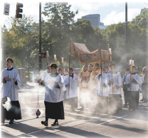
The annual Eucharistic Procession in October 2021