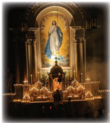
The annual Rorate Mass

St. Ambrose of Milan, most famous for having converted and baptized St. Augustine, is the attributed author of the great Advent Hymn, Veni Redemptor Gentium (Redeemer of the Nations, Come). In this hymn, St. Ambrose describes the miraculous reality of the Incarnation when he writes, "Not from man's seed, but by the mystic spirit, the Word of God was made man, and the fruit of the womb sprung forth." Jesus Christ is conceived by the overshadowing of the Holy Spirit, and we are reminded how the created world was made from nothing but the creative power of God. God acts alone in creation, but in the Incarnation, He freely chooses not to do so. He desires the free cooperation of the Blessed Virgin Mary.