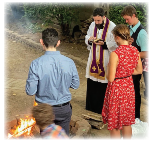
Blessing the fire for the Feast of St. John the Baptist