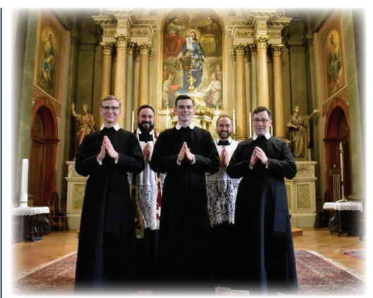
The clothing of the new novices