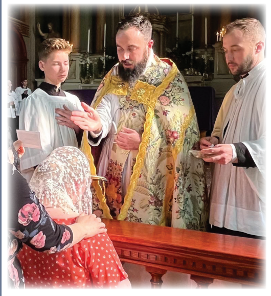
The Sacrament of Confirmation at the Easter Vigil