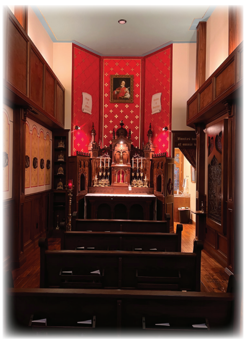
The Main Altar of the Chapel

Recently, we were able to complete the final phase of the Oratory Chapel. This involved painting the ceiling, the space behind and above the altar, and around the Stations of the Cross.