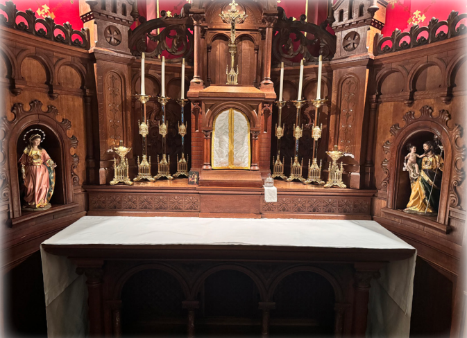
Statues in the niches of the Altar