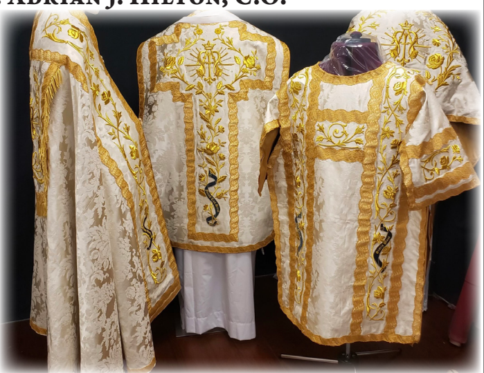
The set makes use of the "AM" monogram standing for "Ave Maria" on the chasuble, cope, and humeral veil.