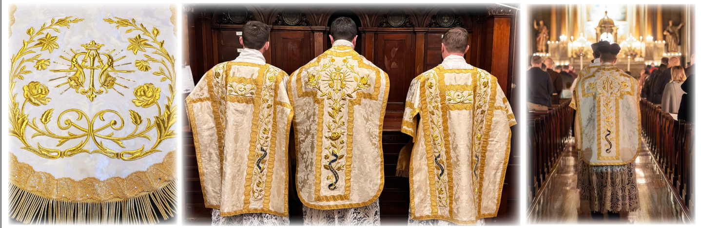
Incorporated throughout the embroidery work, florals of Rose, representing Mary as the "Mystical Rose" of God, and the Lily, showing forth her purity, can be found.