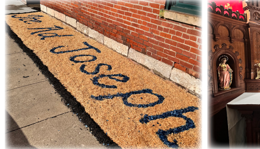
More wood chips