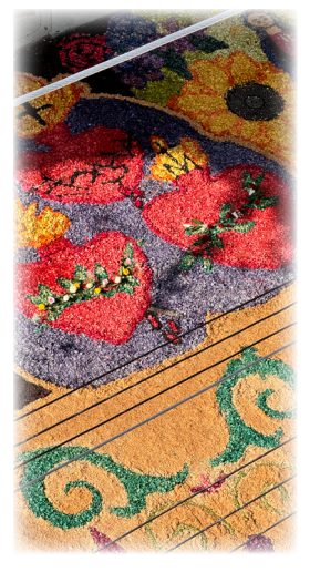
Dyed wood chips for Corpus Christi Procession