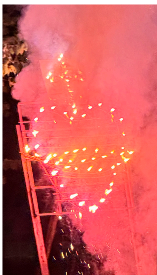
Celebrating the Feast of the Sacred Heart