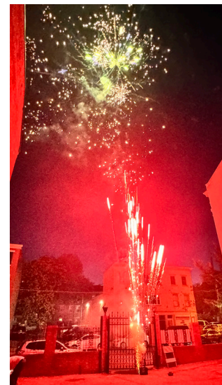
Celebrating the Feast of St. John the Baptist