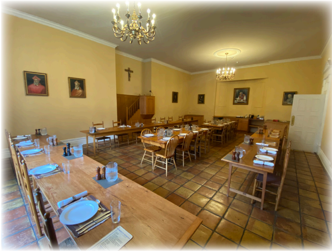
The Refectory (Dining Room) at the Toronto Oratory

Dear Friends of the Oratory, thank you all so much for the prayers and well-wishes which accompanied us on our departure earlier this month.