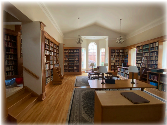
The Library at the Toronto Oratory & St. Philip's Seminary

As we have been at Saint Philip's Seminary in Toronto for a couple of weeks, here is an update. Our schedule is very similar to back home: morning and evening oratory, dinner and recreation. Our mornings are spent in class. Our first exam is in a couple of weeks, so we continue studying to keep what we are learning fresh in our minds.