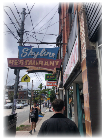
Walking by "Skyline Restaurant" in Toronto

Please continue praying for us so that we may fulfill our duties with generous hearts. Pray that we continue to grow through studies and, even more importantly, through prayer and discipline. Thank you all for your many prayers and support. Nowhere compares to what we have at our parishes, so may we all thank God for our parish and community every day and never take it for granted. I plan to work hard now that I may be a great priest in Cincinnati. I look forward to returning on my breaks and spending my future there.