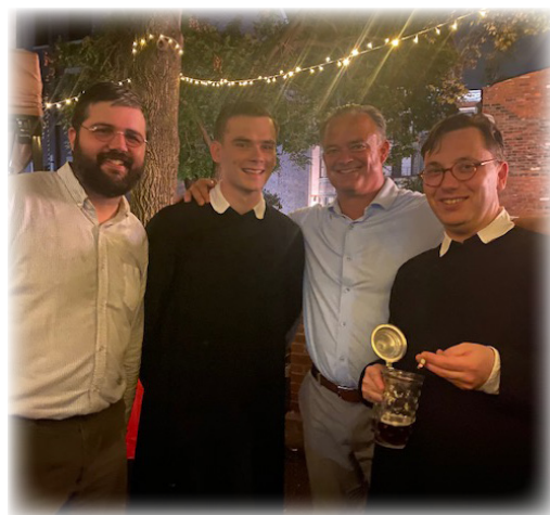
Celebrating the Feast of the Assumption