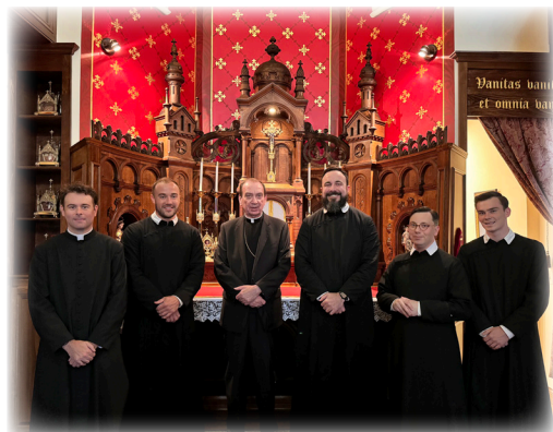
The Archbishop visits the Oratory