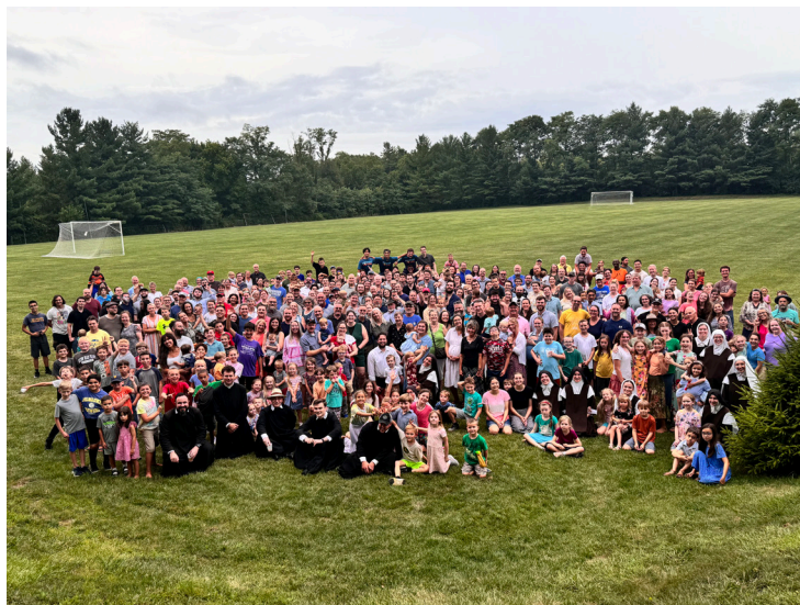
Parish Picnic 2024