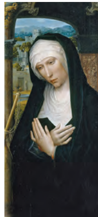
Christ Crowned with Thorns (Eusebius), and the Mourning Virgin (detail), 1530s, Adriaen Isenbrandt