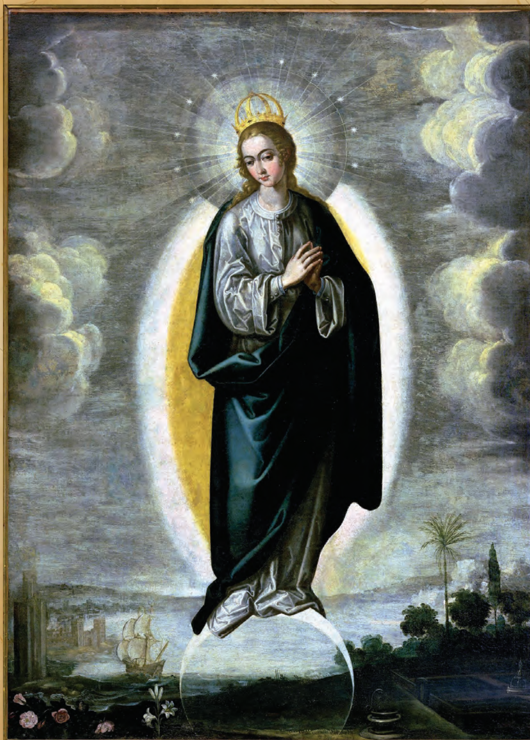
Immaculate Conception, circa 1615–20, Francisco Pacheco