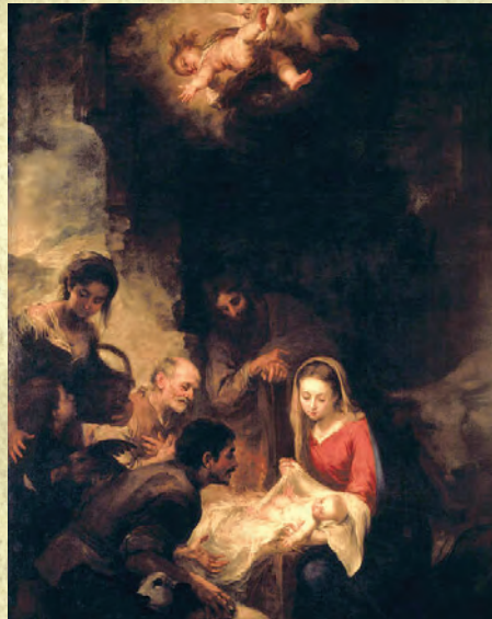
Adoration of the Shepherds Bartolomé Esteban Murillo circa 1668-69