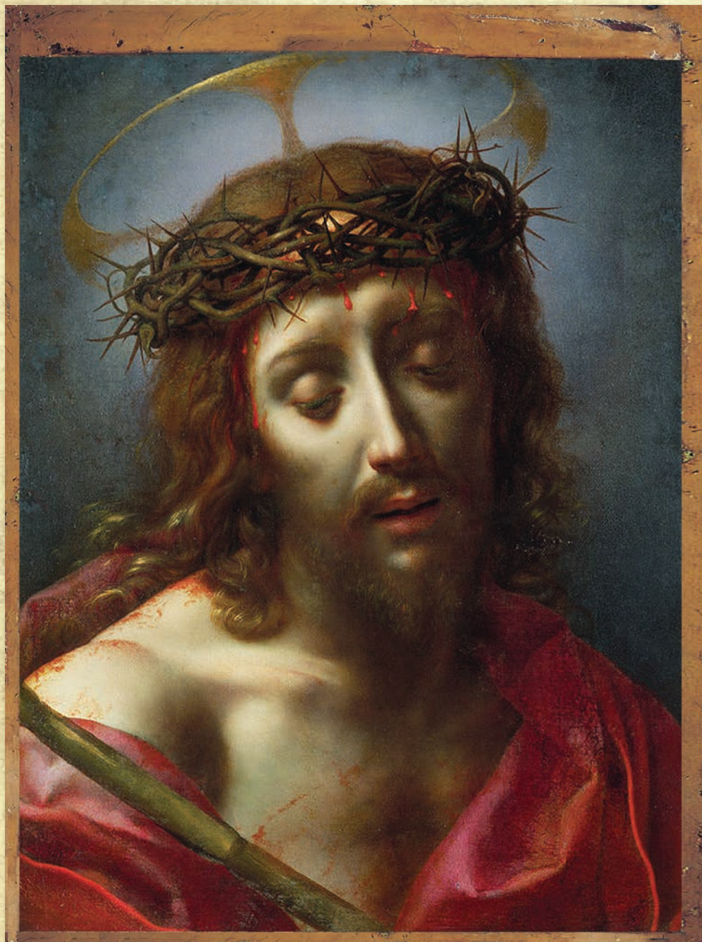
Christ as the Man of Sorrows, Carlo Dolci