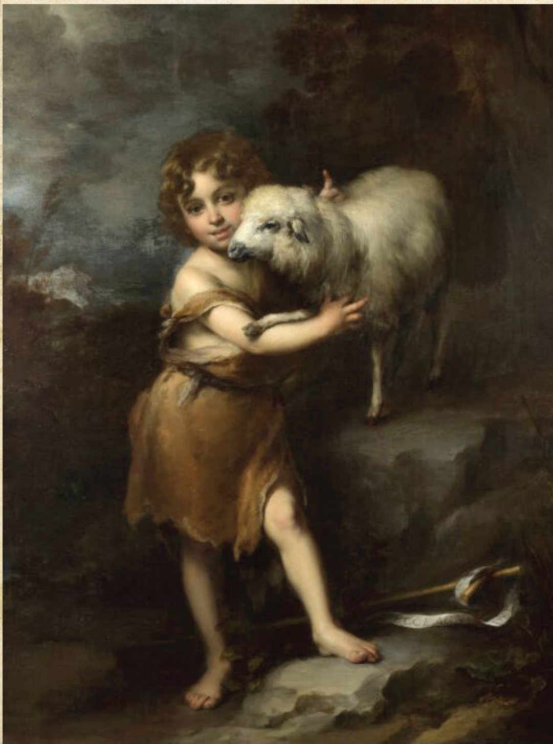
The Infant Saint John with the Lamb, Bartolomé Esteban Murillo