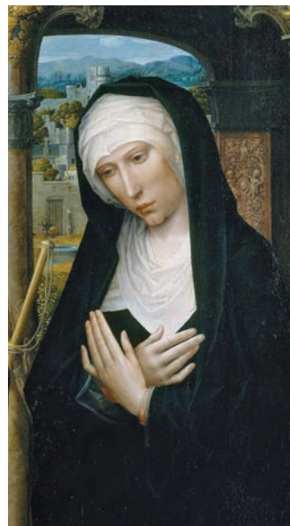
Christ Crowned with Thorns (Euse Homo), and the Mourning Virgin (detail), 1530s, Adriaen Isenbrandt