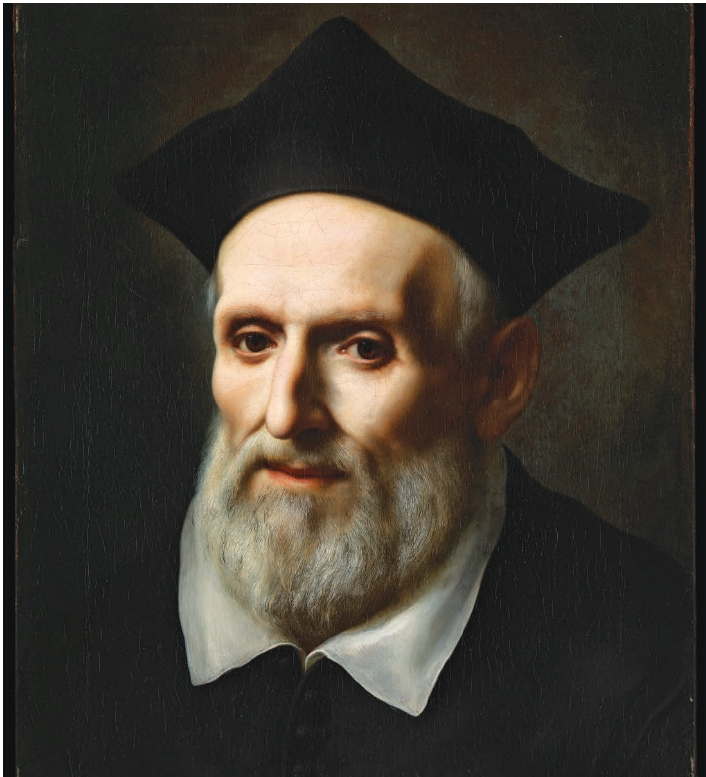
Saint Philip Neri, 1645-1646, Carlo Dolci

SERVED BY THE ORATORY OF SAINT PHILIP NERI