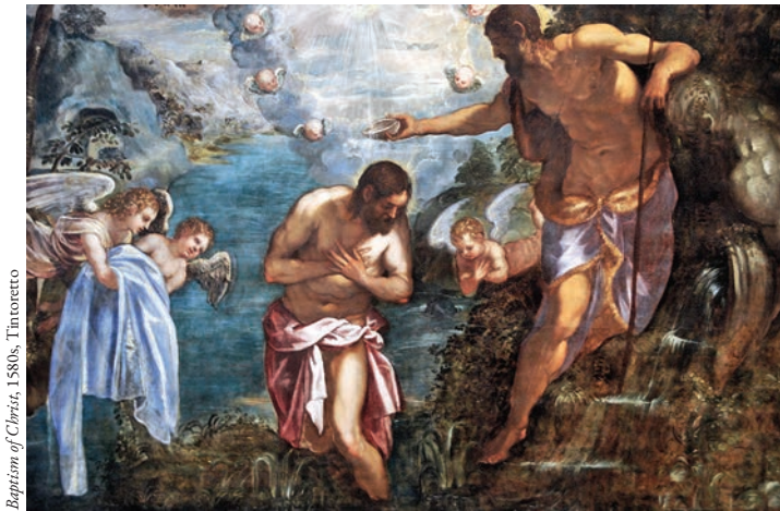
Baptism of Christ, 1580s, Tintoretto

PLEASE do not move or park in a parking spot if the sign indicates that it is for a priest or sister!