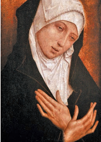
Frigida in Sororia, circa 1480, Simon Marmion