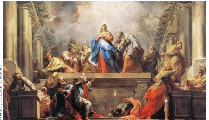
Pentecost, 1732, Jean III Restout

On Pentecost, a Plenary Indulgence is granted to all those who publicly recite or chant the hymn Veni Creator. We will publicly chant or recite the Veni Creator following all Masses at Old St. Mary & Sacred Heart on Sunday, June 5 . The usual conditions of Sacramental Confession, the reception of Holy Communion, detachment from all sin, and prayers for the Holy Father's intentions are in effect.