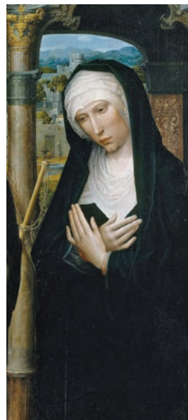
Christ Crowned with Thorns (Euse Homo), and the Mourning Virgin (detail), 1530s, Adriaen Isenbrant