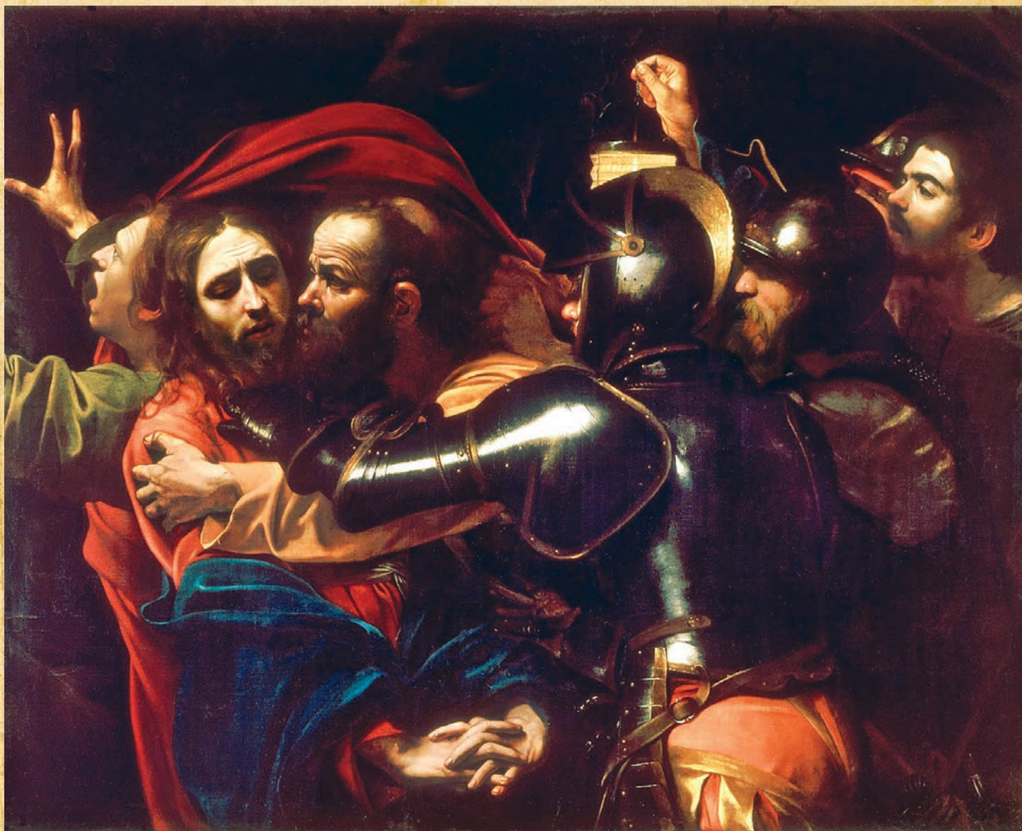
The Taking of Christ, circa 1602, Caravaggio