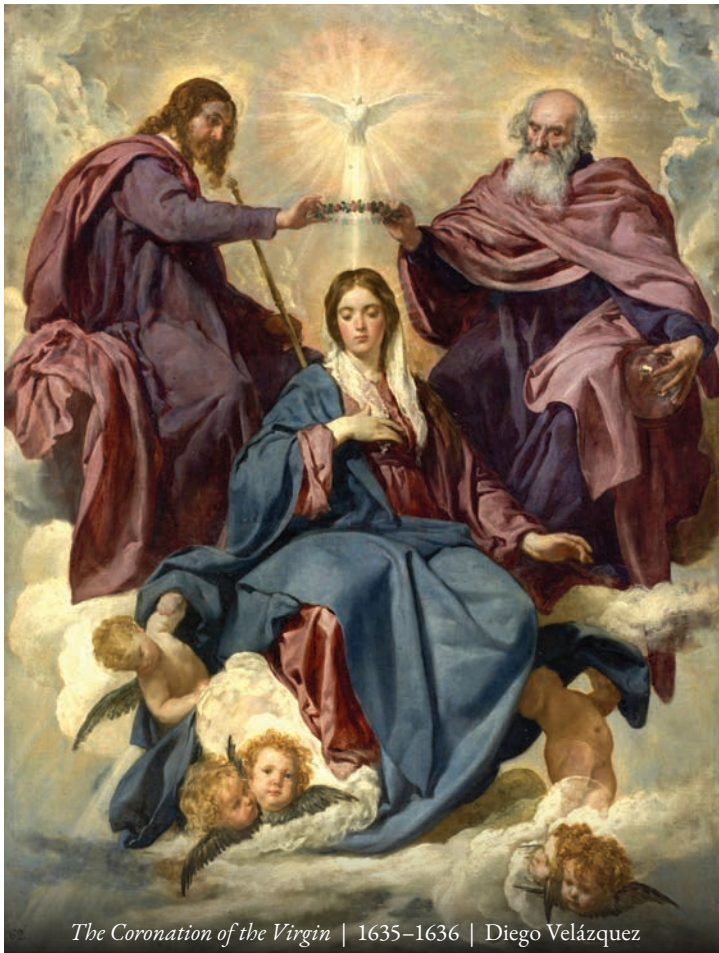
The Coronation of the Virgin | 1635-1636 | Diego Velázquez

“In trial or difficulty I have recourse to Mother Mary, whose glance alone is enough to dissipate every fear.” - Saint Therese of Lisieux