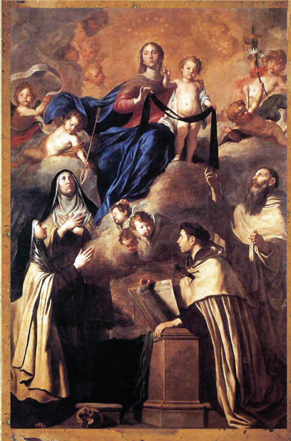
Our Lady of Carmel and Saints, 1641, Pietro Novelli

Served by The Oratory of Saint Philip Neri