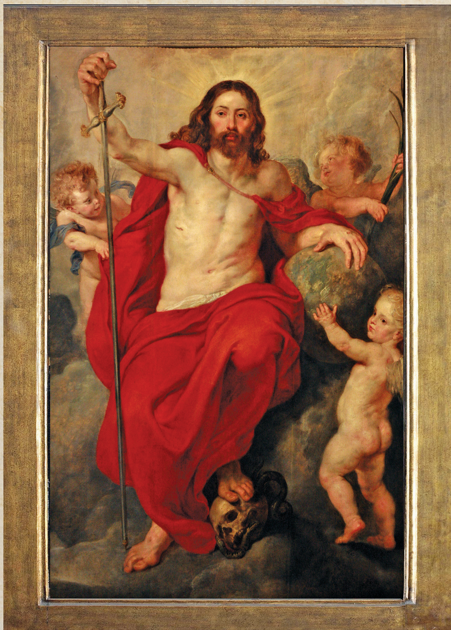
Christ Triumphant over Sin and Death, Peter Paul Rubens