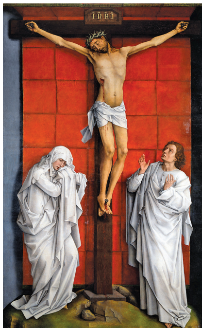
Christ on the Cross with Mary and Saint John, Rogier van der Weyden

Labor Day Masses will be at 7:15 a.m. (Low Latin) and 9:00 a.m. (English) at Old St. Mary. Confession is at 8:15 a.m. There is no 12:10 Mass or Confessions before.