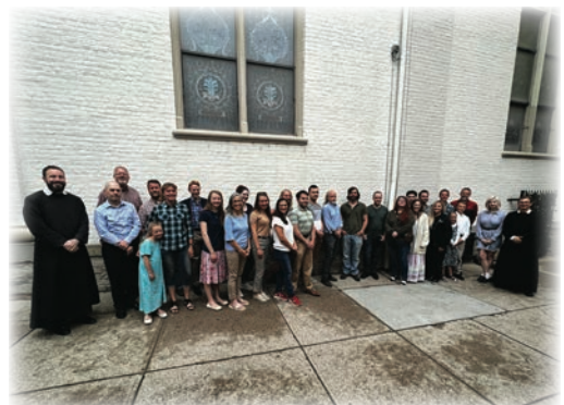
A picture with the catechumens, candidates, and adult confirmandi for Easter 2022