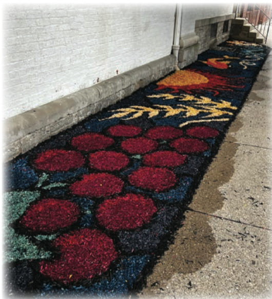
Painted wood chips line the path for the Eucharistic Procession on Corpus Christi