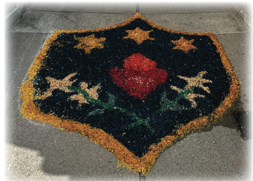
Painted wood chips depicting the Oratory coat of arms along the Eucharistic Procession route for Corpus Christi.