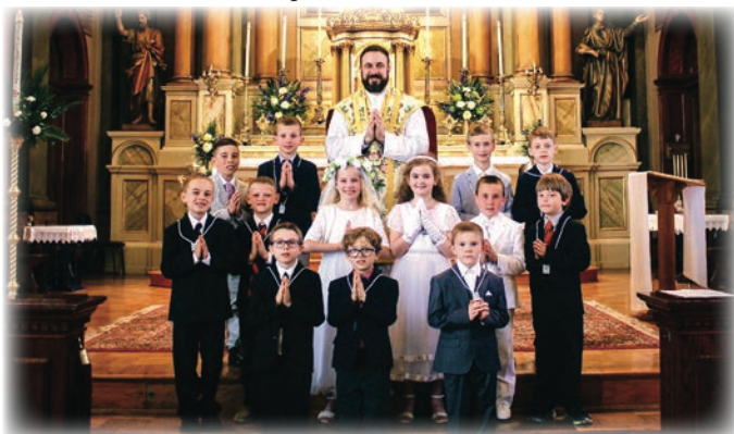
The First Communicants for Old St. Mary's for 2022