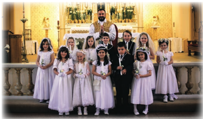
The First Communicants for Sacred Heart for 2022