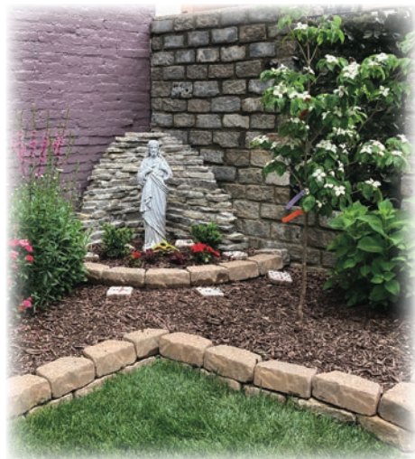
The garden at Old St. Mary's in the summer

With the passing of each season, we are given another opportunity to contemplate our mortality, but this is more beautifully shaped when we consider our advancement in virtue. At the beginning of Summer, we are given the beautiful feast of the Visitation to consider. Our Lady leaves the hiddenness and solitude of her Nazareth to go to Elizabeth. Having heard the words of the same magnificent Archangel Gabriel, Mary goes by the inspiration of Charity to assist her cousin. She goes not out of a strange curiosity to see if she's really with child in her old age or not, but rather a confident drive of charity to assist and fulfill what was told by God's messenger – that which she knows to be true because God has said so. In the hearts where Charity dwells, it burns like a furnace. And our Lady knew this so well as Love Itself was within her womb. Her fidelity to the inspirations of God is an inspiration for us, and we must constantly be listening for the voice of our Beloved, so that we can exhaust our charity and bring about our death to self for the service of the Glory of God. The brightest lights in heaven, are the ones who held nothing back for themselves.