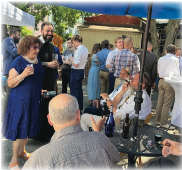
Happy 180th Anniversary, Old St. Mary's!