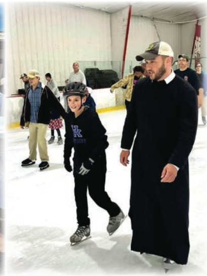
Ice skating for the Feast of Our Lady of the Snows on August 5