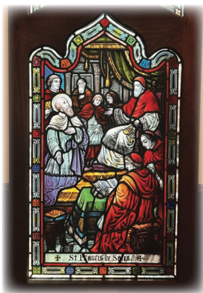
The St. Francis de Sales window in the chapel

The window in the Oratory chapel depicting Saint Francis de Sales shows the Pope sending St. Francis to convert the Calvinists in Geneva. St. Francis de Sales has always been connected with the Oratory of St. Philip. Saint Francis de Sales imbibed the spirit of Saint Philip, and his writings inscribe the spirituality that he learned from the Oratory, and which Saint Philip himself never wrote down.